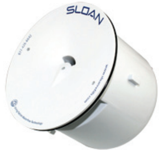
Cartridge only shown in picture.

Cartridge Kit Includes: Cartridge, Cartridge Key, Sealant Package, Protective Glove and Disposal Bag.