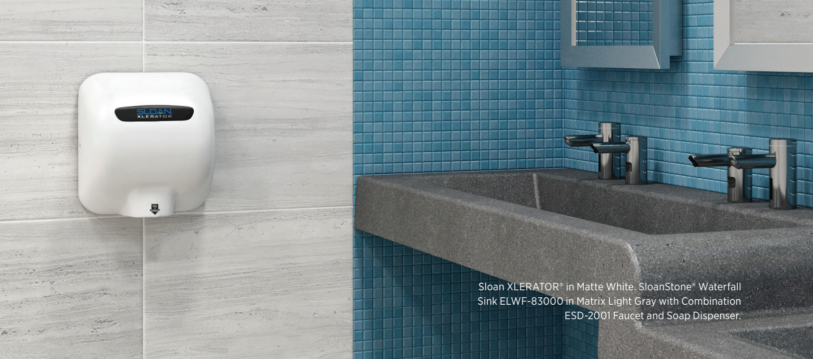
Sloan XLERATOR® in Matte White. SloanStone® Waterfall Sink ELWF-83000 in Matrix Light Gray with Combination ESD-2001 Faucet and Soap Dispenser.