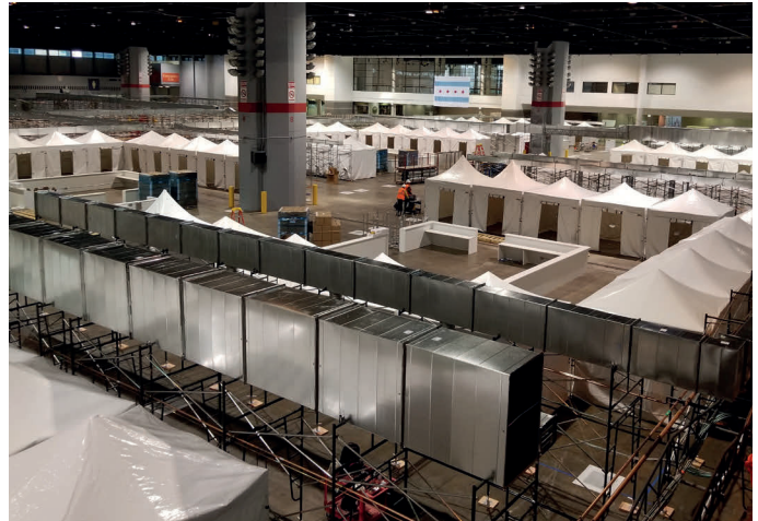
With the cooperation of vendors like Ferguson, Bradford White, Laars, and Sloan, Helm Group (formerly Mechanical, Inc.) and others had the first 500 beds ready to go for COVID-19 patients in a Chicago field hospital set up in McCormick Place convention center.

"We didn't know what to expect, when we got the call to help on the COVID-19 Care Center project at McCormick Place,"