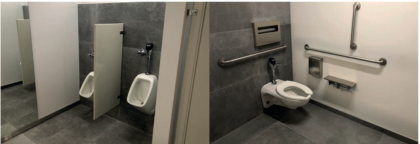
Sloan's Designer Urinals and wall-mounted water closets provide Fulton East with an energy-efficient and touch-free solution.